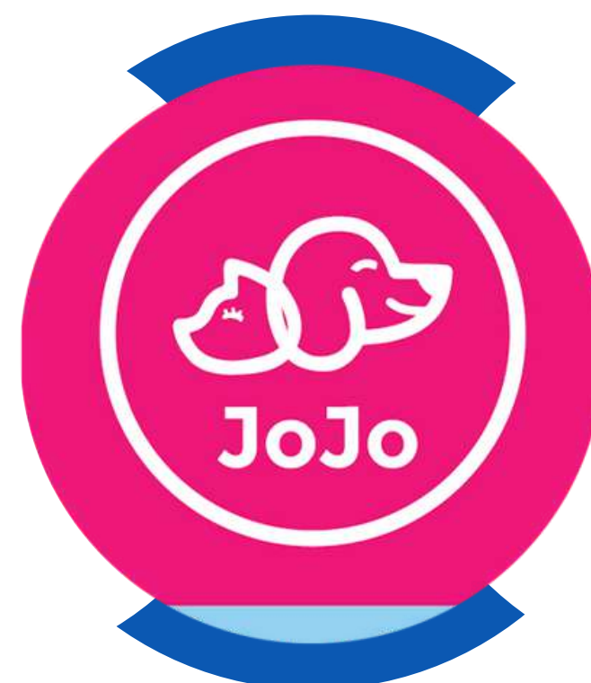
JOJO PETS TAXI