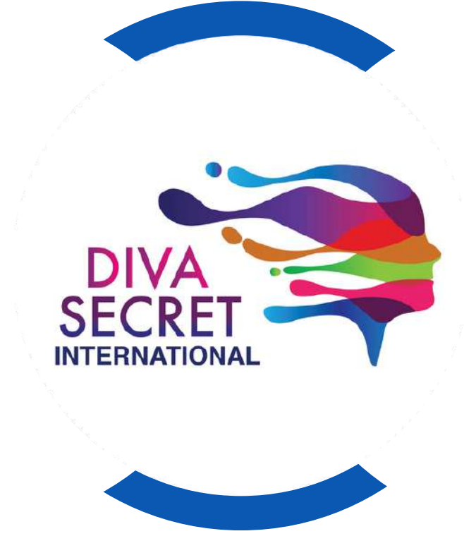
DIVA SECRET INTERNATIONAL